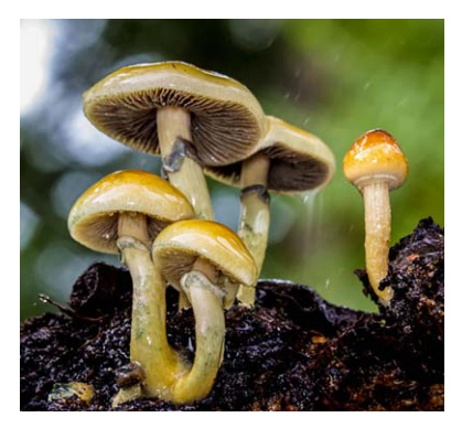
Figure 1 Psilocybe cubensis , one of the species of mushrooms that naturally produce psilocybin, the psychedelic medicine used for most of the recent clinical trials.

results. All patients showed some reduction in depression severity at 1 week that was sustained in the majority for 3 months. According to standard criteria for determining remission (i.e., a BDI score \leq 9), 8 (67%) of the 12 patients achieved complete remission at 1 week, and seven patients (58%) continued to meet criteria for response (50% reduction in BDI score relative to baseline) at 3 months, with five of them (42%) still in complete remission. STAI-T anxiety and SHAPS anhedonia scores also significantly decreased at 1 week and 3 months posttreatment from baseline.